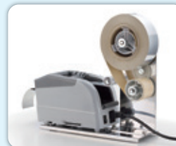
ZCUT-9GRRP Cut a tape with backing paper while removing it